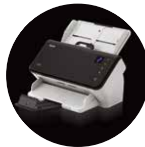
Alaris E1025 and E1035 Scanners

* Throughput speed may vary depending on your choice of application software, operating system, PC and selected image processing features.